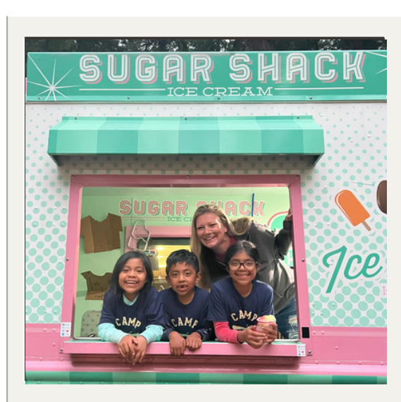
Sugar Shack sweetened up camp last year!